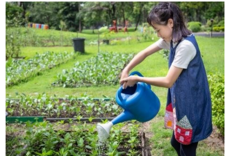
Lean to “Sow and Grow” on March 9

March 9 – Sow and Grow April 13 – Song Fest May 9 – Backyard Cooking June 8 – Packing for Outdoors/Orienteering July 13 – Rope making/knots August 10 – Shelters September 14 – Fingerprinting October 12 – Fire Building November (TBD) – Winter Stuff December 14 – Leather