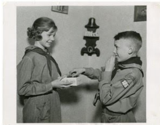
the identity of the Scouts is not known.

As we journey through history, you'll hear engaging stories about the individuals who wore these uniforms - stories of adventure, leadership, and personal growth. Discover how these uniforms represent a sense of belonging, achievement, and the enduring values of Boy Scouting and Girl Scouting.