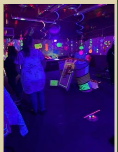
Here is what a Glow Party looks like. Who wouldn't want to be a part of this!

Don't miss out on the glowtastic festivities! The cost is only $15 per person and the price of admission includes a birthday treat. Register as an individual or as a troop online at <u>https://</u> <u>nssm.regfox.com/2023-igl</u>. See you at the 112th Birthday Party!