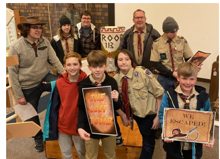
Members of Troop 113 with souvenirs of their escape from the Lost Tomb in March of 2022.

carissa.meyer@nssm.org to express your interest in scheduling your unit or your group for a visit to the Escape Room. Ask anyone who has experienced the Museum's Escape Room – it is a must-do adventure.