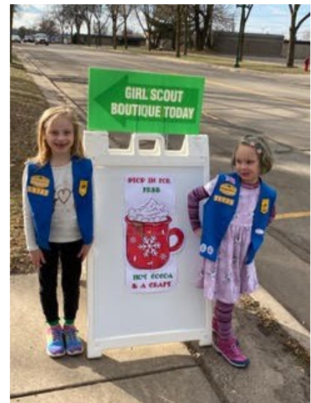
Two Girl Scouts from the North St. Paul Girl Scout Service Unit stand in front of the Museum to promote their Holiday Hop Boutique.