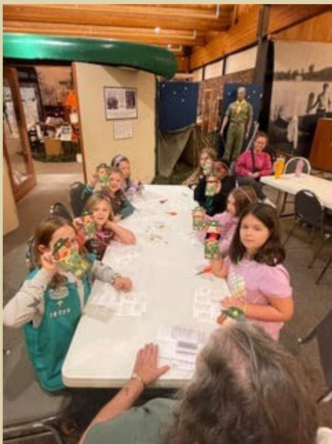
The Juliette Gordon Low Glow Party took place at the Museum on October 27. Before going into the “glow”, the girls made Juliette Gordon Low puppets.