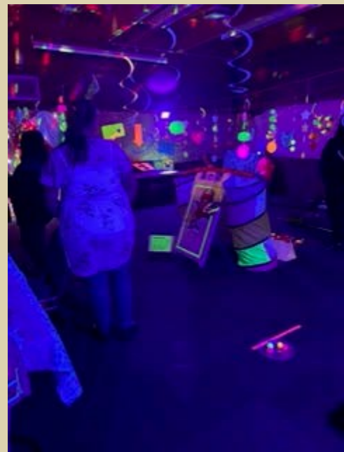
And, when the lights went out and the dark lights went on, it truly glowed.