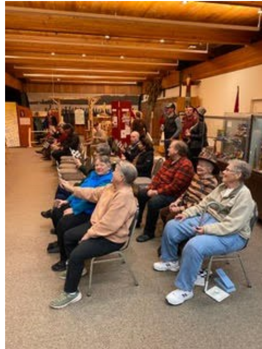
The crowd went wild as cars sped down the Museum’s state-of-the-art track.