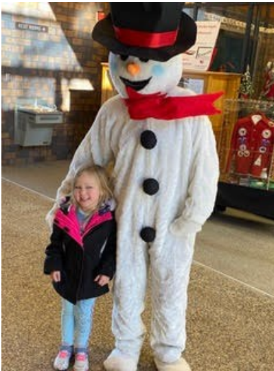
This year, Frosty the Snowman came to the Museum during the Holiday Hop. Although the kids warmed up to Frosty, he did not melt.