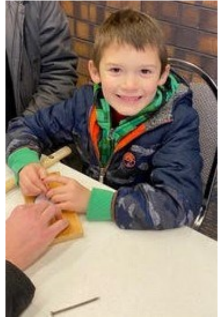
A young visitor is shown making his very own punched tin ornament.