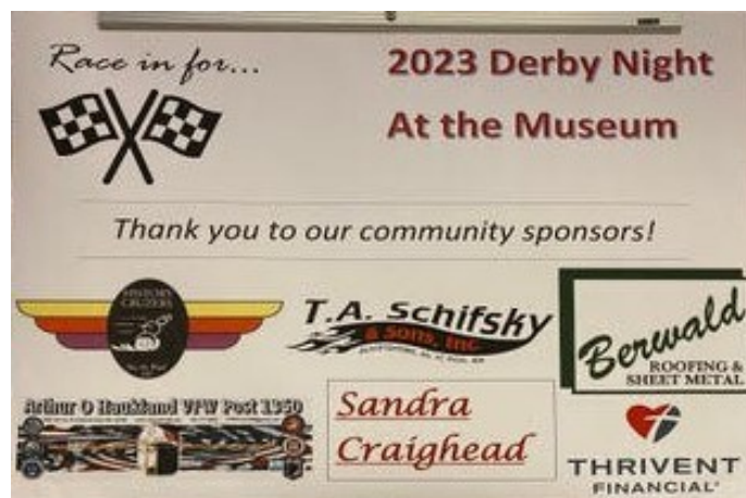
Thank you to our 2023 Derby Night at the Museum Sponsors