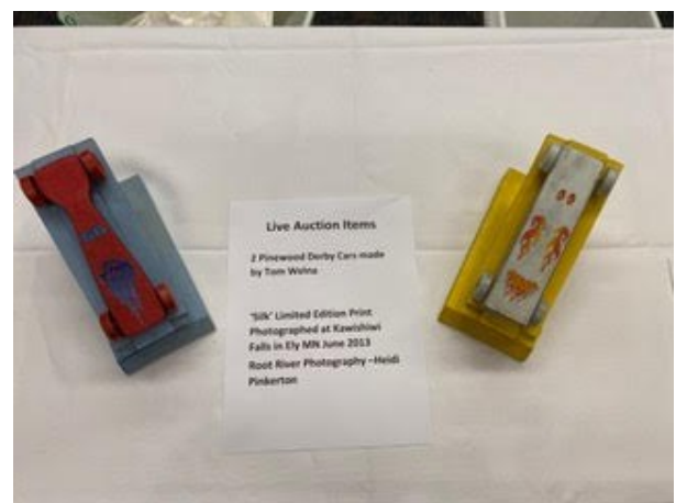
Pictured above are the two Tom Welna custom designed and track-tuned-for-speed cars that were auctioned off live at Derby Night.