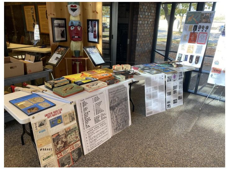
In addition to the opportunity to go on the air, Jamboree on the Air includes some great radio-oriented exhibits.

As for IOTA/IOTI, there is no charge. Scouts of all ages and any gender may participate. Visitors can just show up but if you have a group of five or more, we would appreciate it if you could pre-register so we can plan accordingly. Once registration opens, you will be able to register through the Museum's website at www.NSSM.org. on the website, go to Programs and Events, then Jamboree on the Air, and sign up for a session. See you "on the air" at radio station KØBSA on October 21!