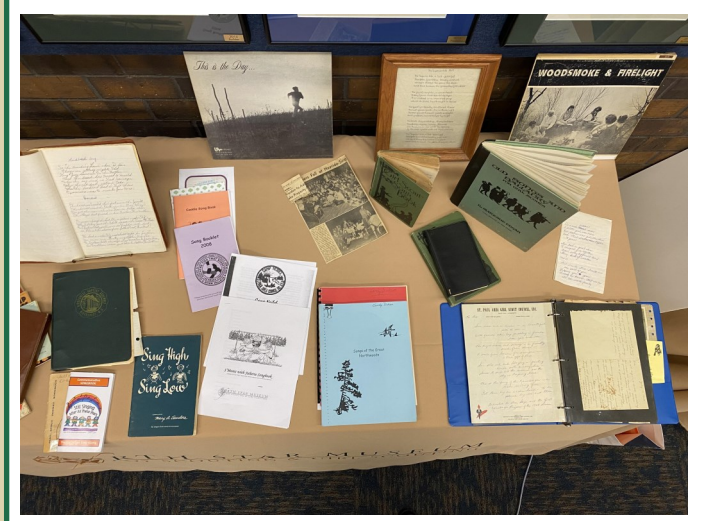
Pictured above are a group of Girl Scout song books and recordings from the Museum's collection. They were on display for the Call to History Road Show .

You did not need to be at the Call to History Roadshow to support the Museum. To make an on-line gift, just use this link: <a href="https://tinyurl.com/NorthStarMuseumGiveNow">https://tinyurl.com/NorthStarMuseumGiveNow</a>. If you would like to view any of the items featured in this year's Call to History Road Show, let us know and a viewing can be arranged.