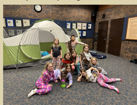
The girls of Brownie Girl Scout Troop 57939 pitched their tent in the Founders Hall.

Would you like to organize a similar event and have a much or even more fun than Troop 57939? Well, you can. The cost is only $30 per girl and it in-