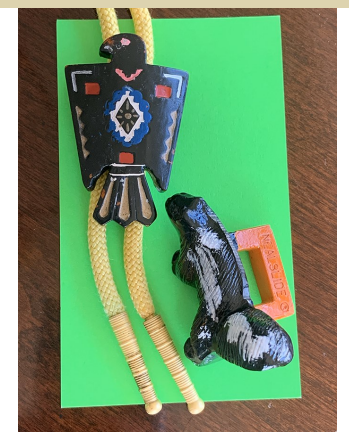
Two stylish Neal products; a bolo and a slide.

pany of Biddeford, Maine. The company produced neckerchief slides during a twenty-five-year period in the 1950s,1960s, and 1970's. Sadly, the company was sold in 1977. During its twenty-five years of existence, this small family business made an estimated two to three million necker-(Continued on Page 3)