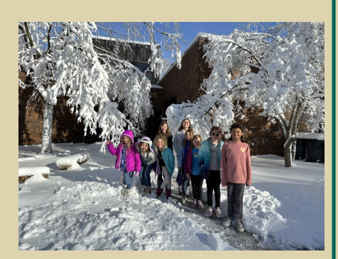
After a warm night tent camping in the Founders Hall, the girls of Brownie Girl Scout Troop 57939 enjoyed the aftermath of the blizzard.

cludes admission and everything necessary to earn the Games Badge or possibly another badge. S'mores are always a part of the overnight as well. Call the Museum at 651-748-2880 for more information or to set up your overnight.