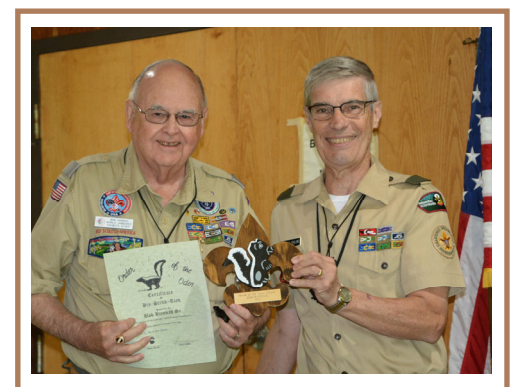
Veteran Scouter (Skunk) Reunion

We have hosted pinewood derbies and Eagle Courts of Honor, as well as other events. A new activity began in 2022 as several troops overnighted at the Museum. In addition several units have held one of their monthly meetings onsite. More programs, more visitors and more volunteers are expected to grow.