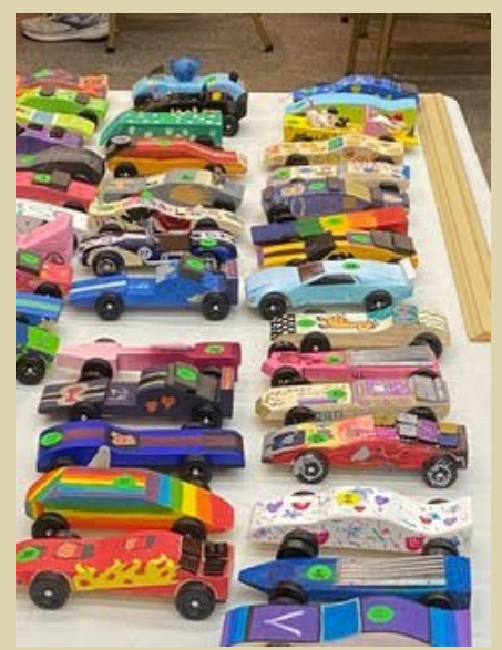
On April 14, the Roseville Girl Scout Service Unit held a Pinewood Derby event at the Museum. A total of 45 cars entered the race. Look at these great designs!