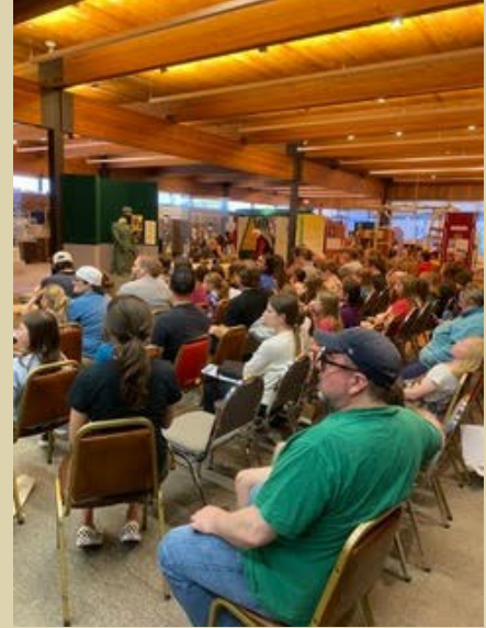
The Roseville Service Unit of Girl Scouts brought quite an entourage to its Pinewood Derby event at the Museum on April 14.