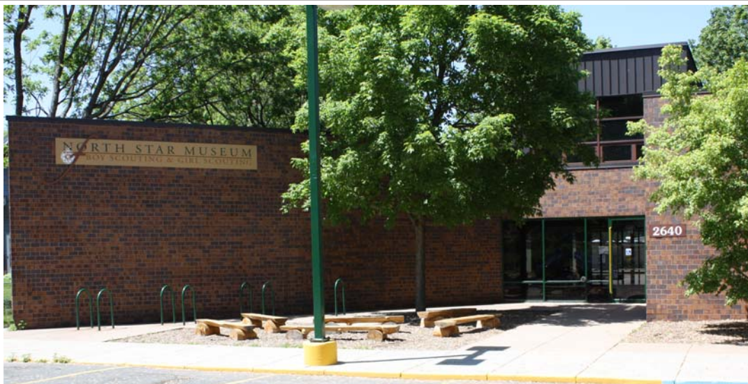
New signs have gone up at the Museum!

The money raised through the campaign will pay off the note with Ramsey County, provide funds for ongoing maintenance of our building, and assist with operating and program support. The campaign will also help the Museum build a fund-raising infrastructure that will place it in a better position to meet annual operating fund needs in the future. When called upon, please lend your support to the campaign.