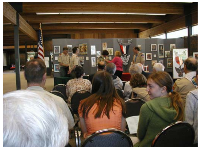
The Museum is a great place to hold an Eagle Scout Court of Honor!

We will be providing the boys with a card that has all of the flag signals on it, but maybe you can help them decipher the process!