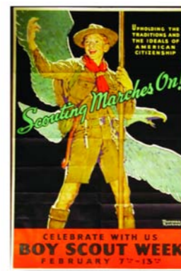
1930's Norman Rockwell Poster

Our new home allows us to preserve the artifacts in our collection better than ever. There are many volunteer opportunities in the collections program. The Museum can also provide opportunities for boys and girls to learn more about caring for their personal collections through Collections (Boy Scouts)/"Collecting" Hobbies (Junior Girl Scouts) merit badge programs.