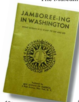
1937 Jamboree booklet

The Museum owns rare, one-of-a-kind objects, like a bronze medallion given to St. Paul area Scouts for their sale of war bonds during the Second Liberty Loan in 1917, a canoe made entirely out of orange crates by a Mahtomedi Boy Scout, and a bicycle from a National Jamboree in the 1970s. More than 10,000 patches and merit badges (Boy Scout and Girl Scout) show the variety of programs and the progress of individual girls and boys. Films, photographs, and oral history supplement the collections.