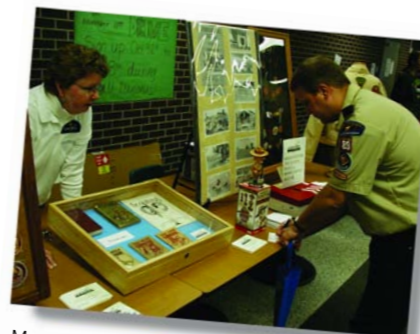
Museum display at U of Scouting

For many years, the North Star Museum made itself known in Boy Scout and Girl Scout circles through its "Museum Without Walls" program, which brought the collection to a variety of communities. Even though we now have a place to call home, this program continues. Call today to book a portable display for your next event.