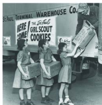
From our display celebrating 90 years of Girl Scouting, photo from 1953

The North Star Museum provides opportunities for Boy Scouts and Girl Scouts, old and new, to share their memories and their stories. Our exhibits offer a chance for Boy Scout and Girl Scout veterans to relive their best experiences, remember old friends, and reflect on the past.